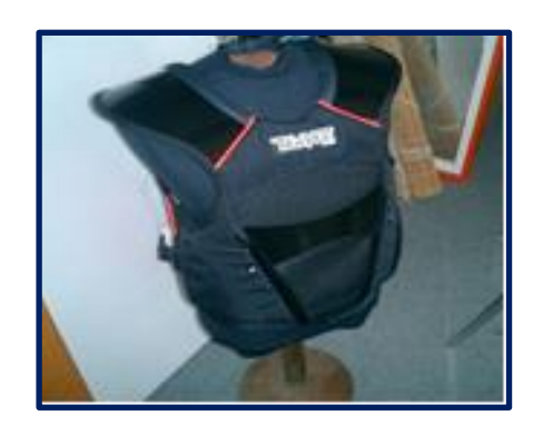
SX ProLite Sold with permanent arm pads